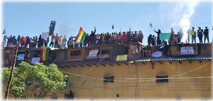
Prisoners on roof protesting lack of medical care as Covid-19 cases & death toll rises in their prison

Bolivia appears to be slowly resurfacing after six months under strict regulations. March to May saw extreme measures which only allowed citizens out of their homes one day a week for 4 hours. June opened up, allowing for vehicle use and two outings a week; however, July went back into strict lockdown including an 11 day full quarantine stretch before returning to the 4 hour a week model. August allowed for two days a week and September is now largely open on weekdays with an evening curfew.