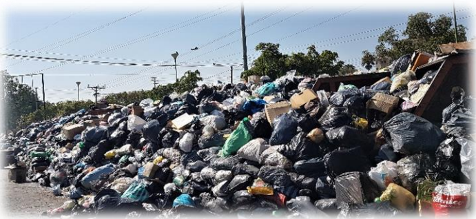
Garbage pickup inhibited by political protests & blockades

Bolivia has experienced some of the highest deaths per capita globally from Covid-19, as many health services have been overwhelmed. Many of our friends and ministry partners have contracted the disease, and sadly, some have succumbed to it.